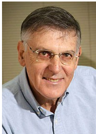
Distinguish professor Dan Shechtman Technion University Nobel Prize laureate in Chemistry 2011.

Among Croatian academic lecturers, the Seminar will host four prominent lecturers from Israel