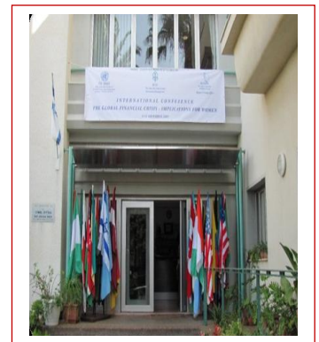
The Golda Meir Mount Carmel International Training Center

**Medical Declaration Please provide a signed letter from your doctor confirming your fitness to attend the seminar.