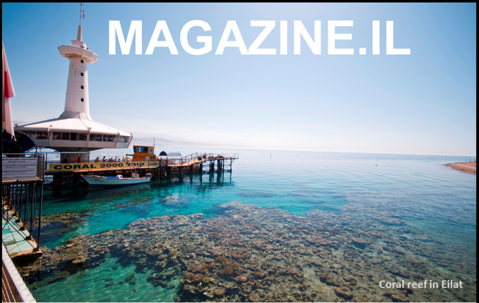
Coral reef in Eilat