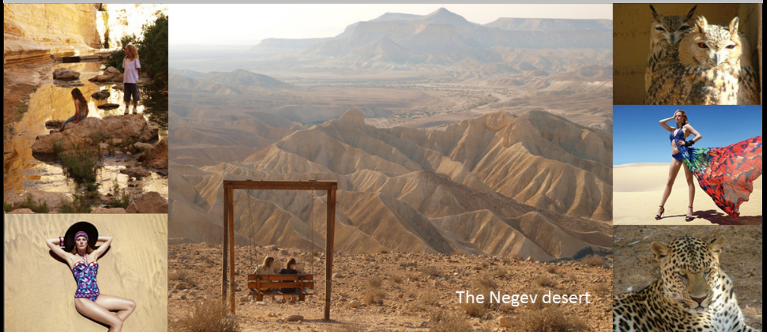
The Negev desert

Head of Culture Department Consulate General of Israel