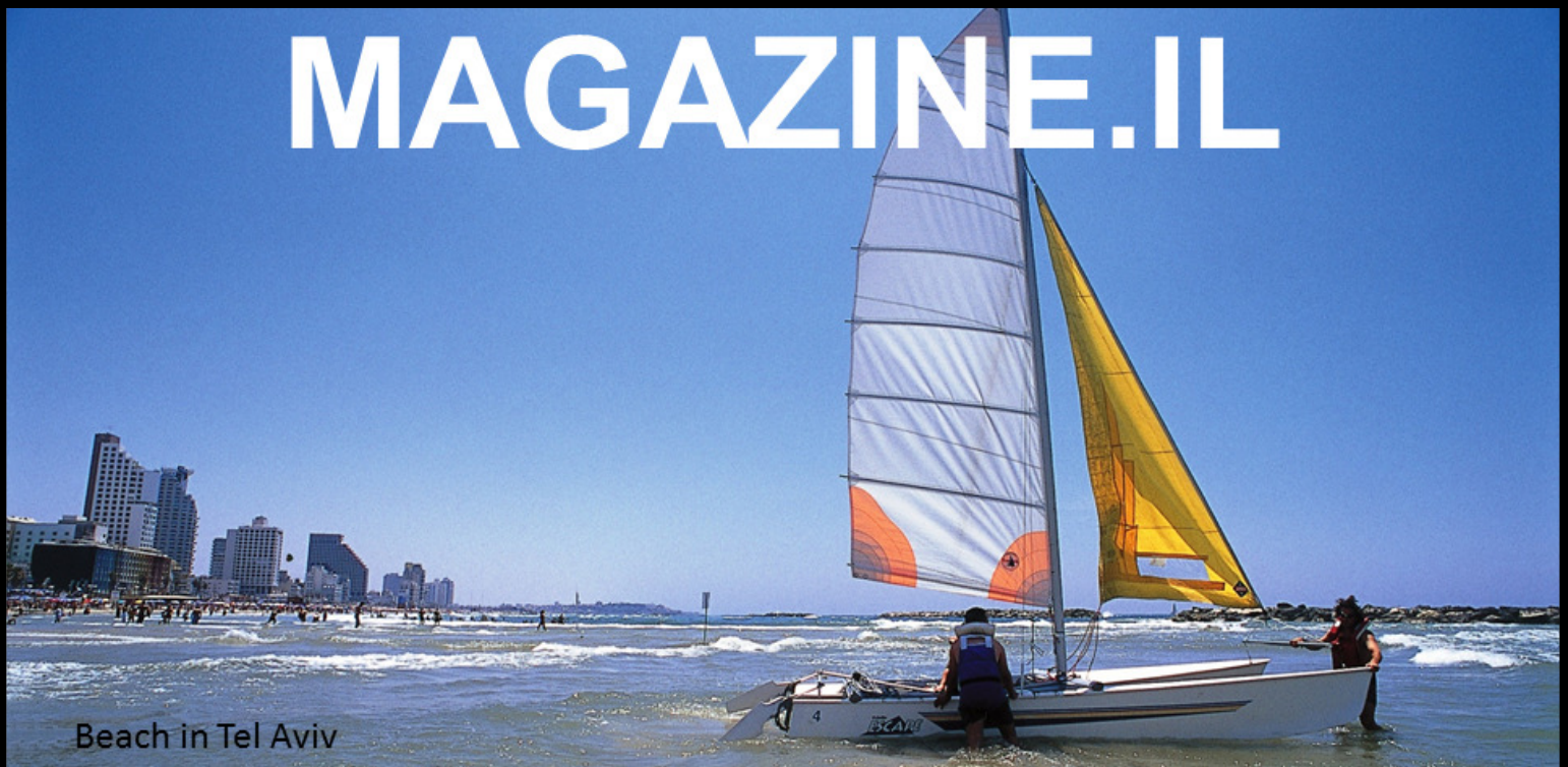
Beach in Tel Aviv