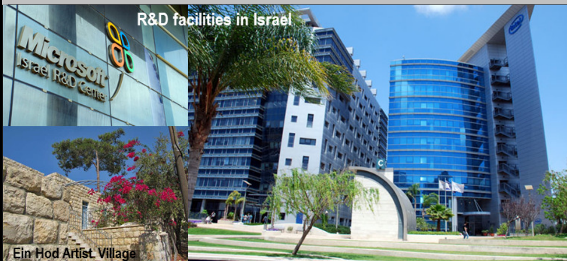
R&D facilities in Israel

Head of Culture Department, Consulate General of Israel