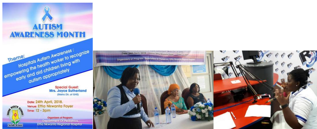
Radio talk show on Autism Awareness

Here are some pictures from on autism awareness program.