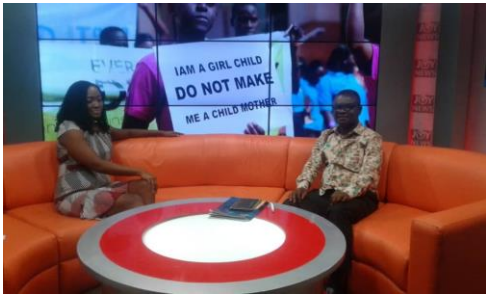
Advocacy for child rights and against abuse